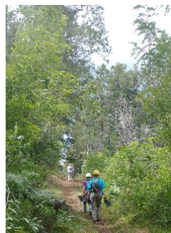
Getting ready for TWM, wearing past years' volunteer shirts!