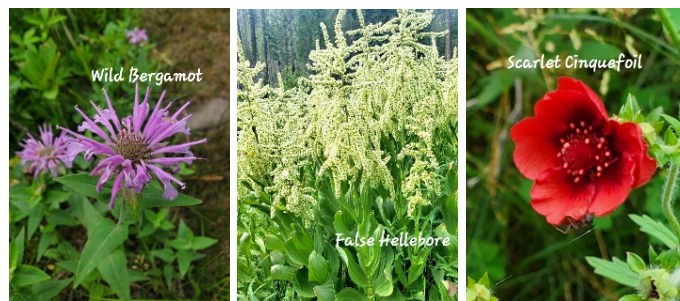
Our thanks to Joanie Porterie for her amazing photos!

What a season this has been for hiking in our beautiful White Mountains. This past July/August, the hikes have been free of mud and mosquitos due to our late monsoon. Plus, nice cloud cover kept the temperatures comfortable. Up The Hill hikes have been averaging 10-12 hikers which is manageable on the Wilderness Trails. On the Greer hike, the wildflowers were in full bloom with magnificent colors. We've seen Scarlet Cinquefoil, Blue Flax, Wild Bergamot, False Hellebore just to name a few. The wild raspberries and gooseberries have been a nice snack as we hiked along the trails. During a hike on the Indian Springs Trail, near Big Lake, we didn't see many flowers but did see horned lizards, an Arizona Tree Frog, a hawk, and a group of wild horses. Surprising we haven't seen many mushrooms. More the reason to join us in September!