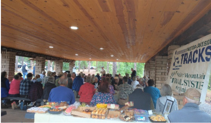
What an awesome crowd we had!