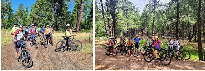
Great mountain biking memories!