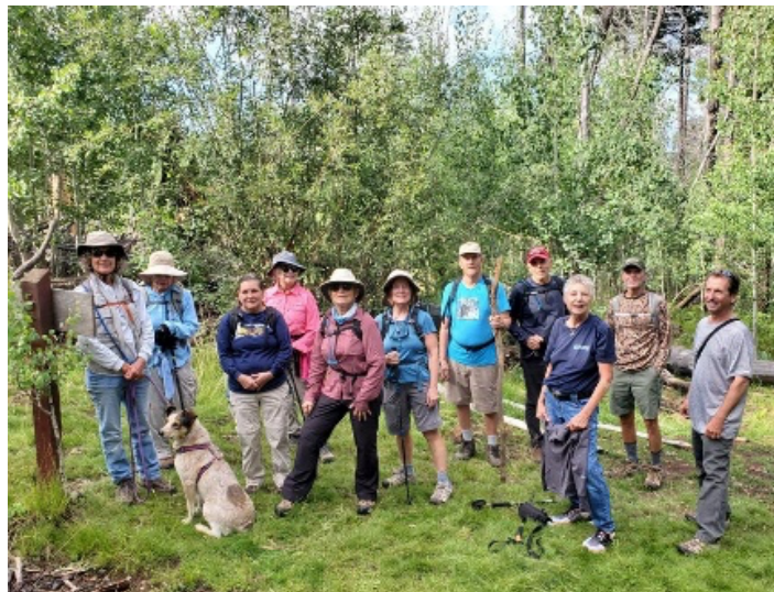
Group of hikers at Indian Springs

The White Mountain TRACKS Up the Hill Gang invites you to join our Wednesday morning summer 2023 hikes! Meet at W-Z Ramen-Hibachi Kitchen, 44 E White Mountain Blvd, Pinetop at 6:45 AM unless otherwise indicated.