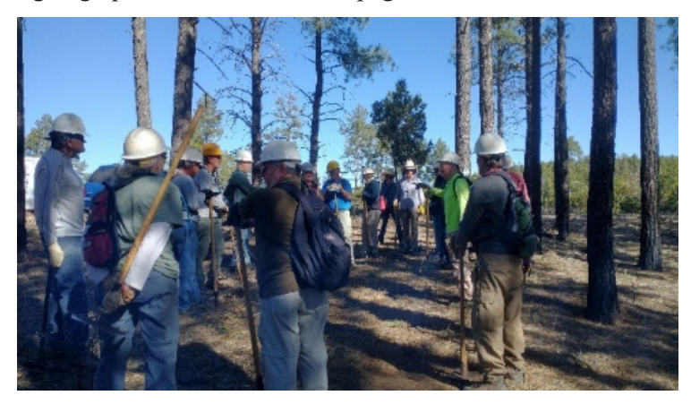
April 10th – First day!

We had a great turnout of volunteers not only on our first day of the season, but also as many volunteers for the second Monday. We hope it continues as there is a lot of work ahead for us! The crew has been working on General Crooks Trail. We also put the Walnut Creek foot bridge back in place after the rains moved it downstream about 15 feet. Anyone who would like to help, please join us by signing up on the TRACKS webpage. !